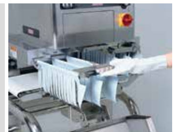
Fast, tool-free access for cleaning