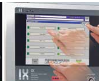
Simple operation with rapid changeovers