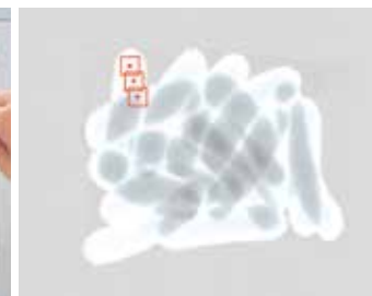
Extra-sensitive detection (GA algorithm)