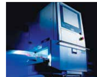
Dust and moisture resistant design

The IX-GA system provides you with secure, retrievable records. Operation logs and images are automatically stored with a time stamp. All data can be saved to a CF card, and are accessible using standard PC applications. The system has an Ethernet option for integration into your wider quality and traceability systems.