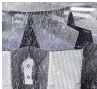
IP69K certified for fast washdown