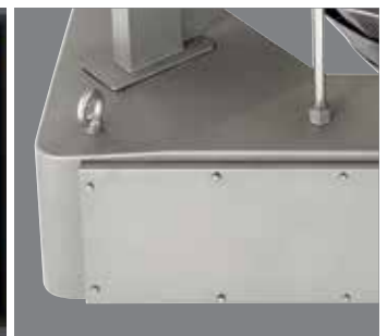
Sloping weigher body speeds up drying (Waterproof specification only)