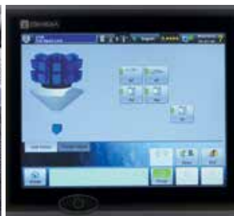
Enhanced operator interface options including hand held tablet control