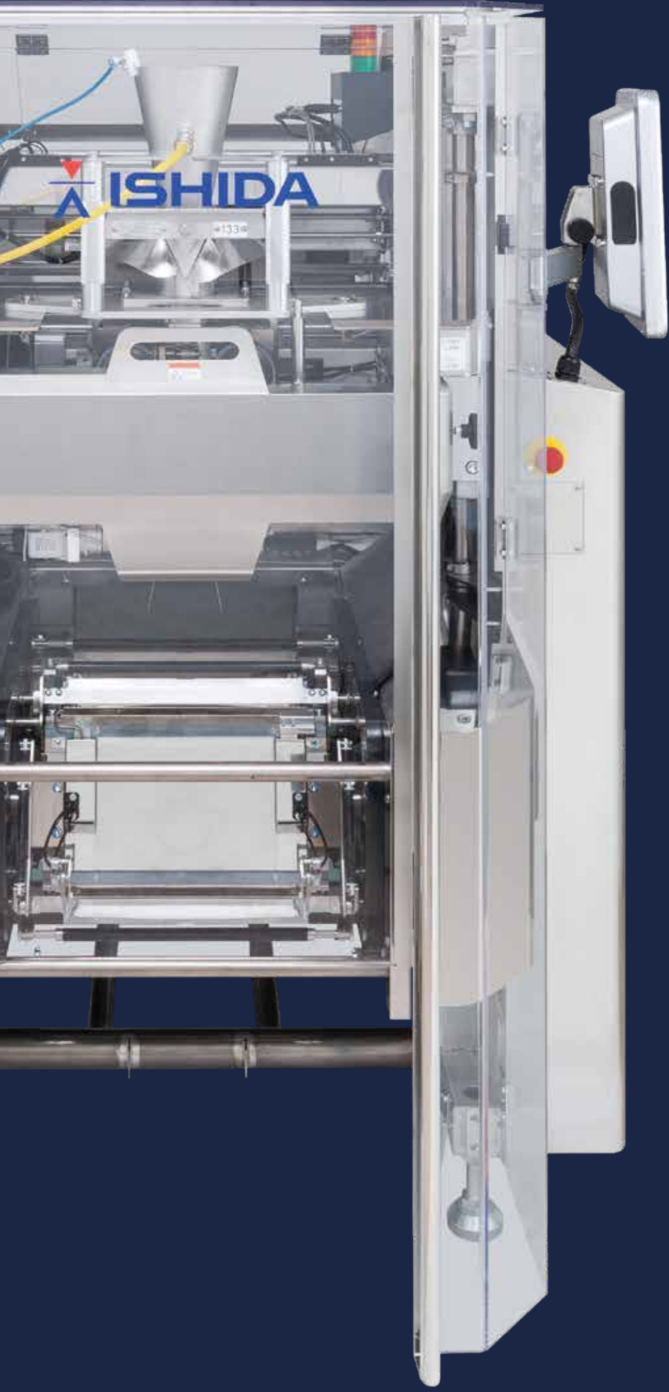
Snack Food Bagmaker