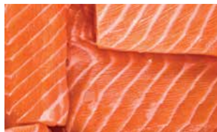
Fish & seafood