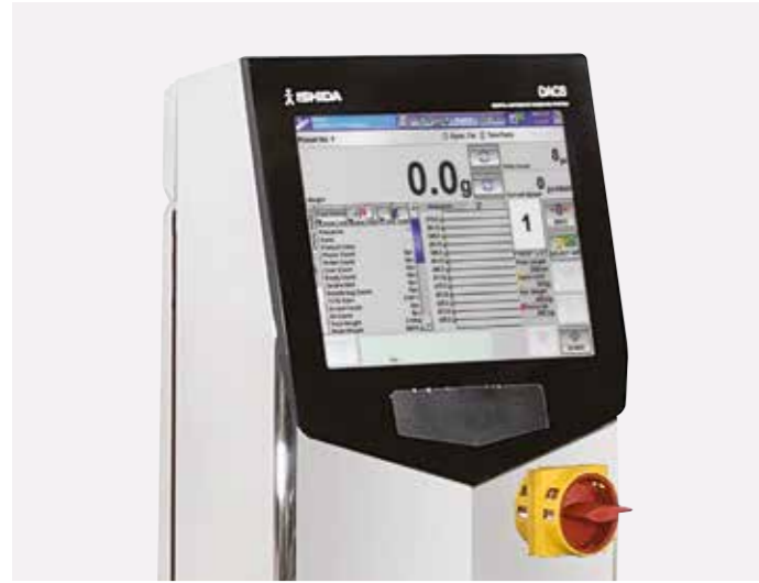
Simple operation - Remote control unit (RCU)