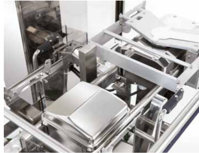
Open frame design