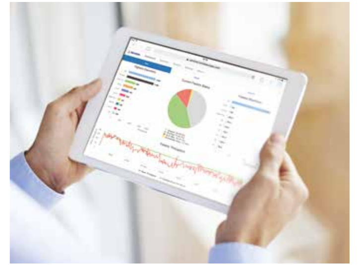
Increased productivity with Industry 4.0