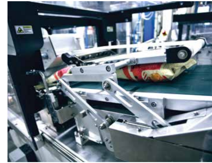
Speed, accuracy and precision