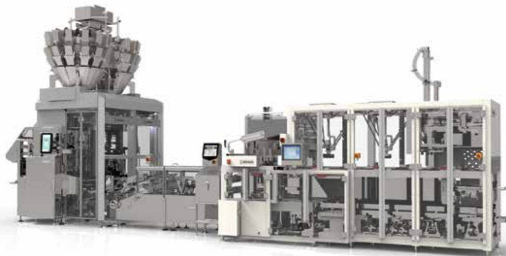
Integrated weighing and packaging solution