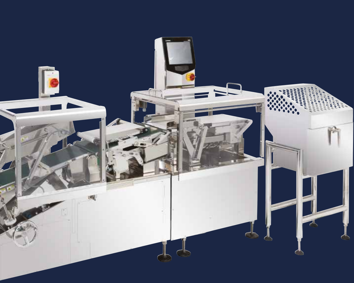
Seal Tester - Checkweigher