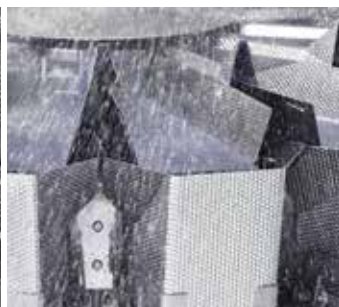
IP69K certified for fast washdown