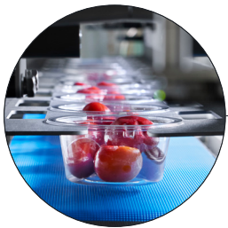
Gripper arms for precise product handling

Developed in consultation with world-leading customers, our tray sealers deliver increased productivity with significant cost savings in energy usage and overall production costs. Providing all the benefits of advanced automation while making the smartest use of your floorspace, materials and budget.