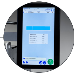
Smart user interface for easy set-up and intuitive diagnostics