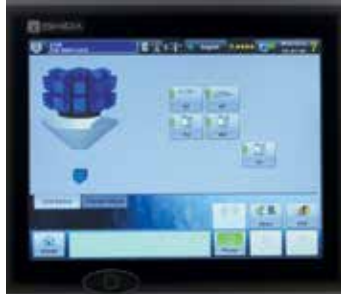
Enhanced operator interface options including hand held tablet control