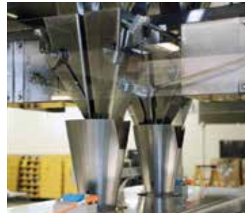
Two single twin timing hoppers deliver up to 400wpm

To fully meet the EU's Restriction of Hazardous Substances Directive (RoHS) non-hazardous materials have been used for all circuit boards, parts, materials and finishes.