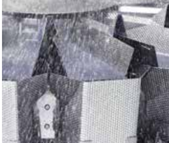
IP66 for fast wash down