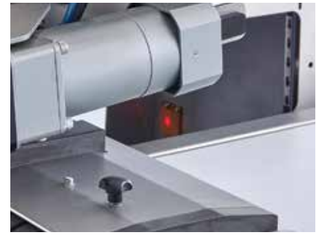
Bin full and reject confirmation sensors