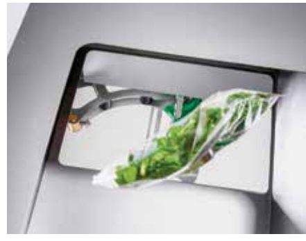
Standard air reject