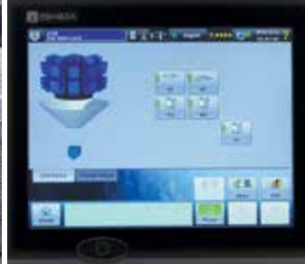
Enhanced operator interface options including hand held tablet control