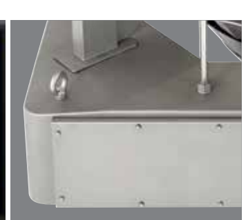
Sloping weigher body speeds up drying (Waterproof specification only)

ISHIDA EUROPE LIMITED Kettles Wood Drive Woodgate Business Park Birmingham B32 3DB United Kingdom Tel: +44 (0)121 607 7700 Fax: +44 (0)121 607 7888 info@ishidaeurope.com