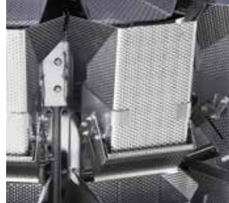
Faster opening and closing of hoppers

To fully meet the EU's Restriction of Hazardous Substances Directive (RoHS) non-hazardous materials have been used for all circuit boards, parts, materials and finishes.