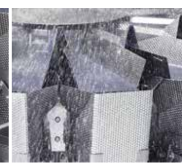
IP69K certified for fast washdown